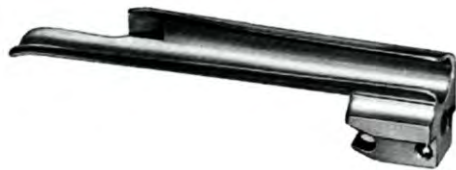
BC-20-157 Fig. 2 for adolescents para adolescentes pour adolescents

Working length largo util Longueur utile 70 mm