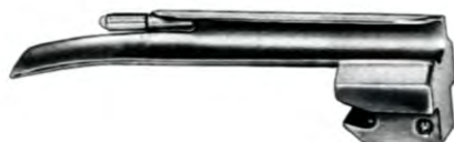
BC-20-108 Fig. 1 for children para niños pour enfants

Working length largo util Longueur utile lunghezza operante 55 mm