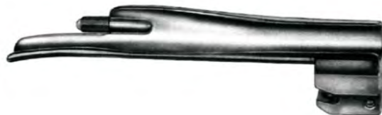
BC-20-127 Fig. 3 for women para mujeres pour femmes

Working length largo util Longueur utile 90 mm