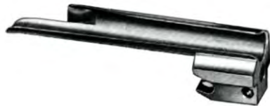
BC-20-156 Fig. 1 for children para niños pour enfants

Working length largo util Longueur utile 55 mm