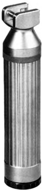
BC-20-165 Battery handle Mango de pilas Manche a pile