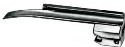
BC-20-161 Fig. 1 for children para ninos pour enfants

Working length largo util Longueur utile 55 mm