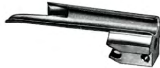
BC-20-155 Fig. 0 for babies para neonatales pour nourrissons

Working length largo util Longueur utile 55 mm