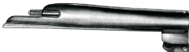
BC-20-128 Fig. 4 for men para hombres pour hommes

Working length largo util Longueur utile 110 mm