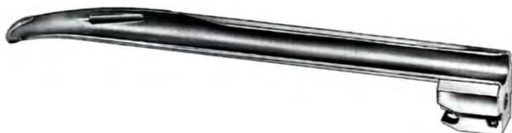
BC-20-163 Fig. 3 for women para mujeres pour femmes

Working length largo util Longueur utile 130 mm