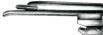
BC-20-125 Fig. 1 for children para niños pour enfants

avec trois spatules a laryngoscopie fig. 2 a 4 complet, en trousse