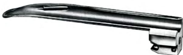
BC-20-162 Fig. 2 for adolescents para adolescentes pour adolescents

Working length largo util Longueur utile 80 mm