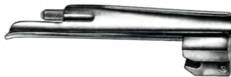
BC-20-126 Fig. 2 for adolescents para adolescentes pour adolescents

Working length largo util Longueur utile 70 mm