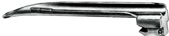
BC-20-109 Fig. 2 for adolescents para adolescentes pour adolescents

Working length largo util Longueur utile 80 mm