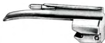
BC-20-107 Fig. 0 for babies para neonatales pour nourrissons per neonati

Working length largo util Longueur utile lunghezza operante 55 mm