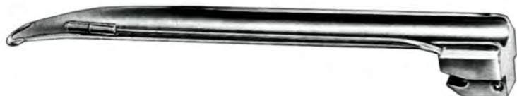
BC-20-110 Fig. 3 for women para mujeres pour femmes

Working length largo util Longueur utile 130 mm