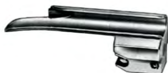
BC-20-160 Fig. 0 for babies para neonatales pour nourrissons

Working length largo util Longueur utile 55 mm