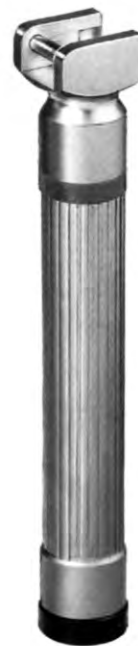
BC-20-166 Battery handle slim, for F.O. Laryngoscope blades with xenon bulb, 2,5 v

Mango de pilas delgado, para mango de laringoscopio luz fria con bombilla de xenon, 2,5 v