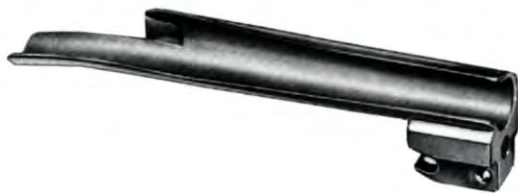
BC-20-158 Fig. 3 for women para mujeres pour femmes

Working length largo util Longueur utile 90 mm