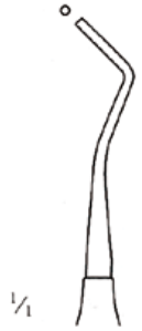
DI-12-113 Fig. 1