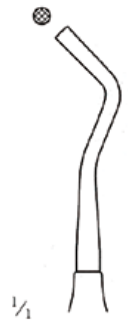
DI-12-118 Fig. 3S